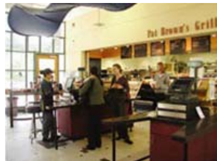
Pat Brown's Grille and the GPB Lawn are closing temporarily.

in the Genetics and Plant Biology and Pat Brown's Grille area.