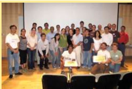
Bioinformatics Core Training Participants

Now in its 8th year, the UC Davis Bioinformatics Training Program will be holding three workshops in the upcoming months: