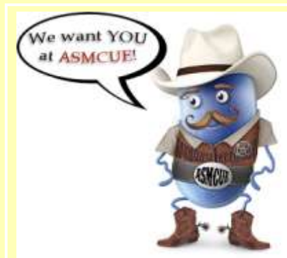
22nd Annual AMSCUE