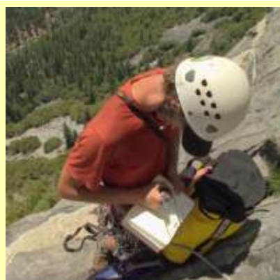
National Park Scientist at work

More information: parksforscience.berkeley.edu