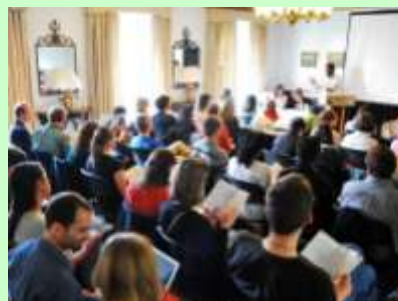
2014 Beyond Academia Conference

Full Article: pmb.berkeley.edu/news/looking-beyond-academia Registration and more info: beyondacademia.org