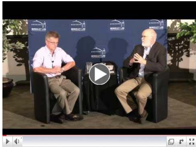
Customizing plants for biofuels.