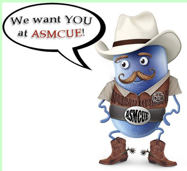
22nd Annual AMSCUE